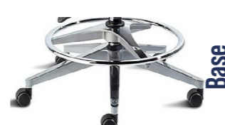
Resistance casters featuring a semi-soft tread that won't roll away easily