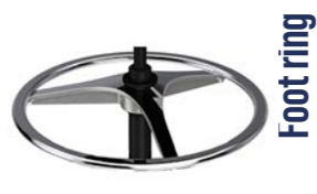
Optional height adjustable stainless steel footring – 22" diameter slides easily, holds positively and stays put