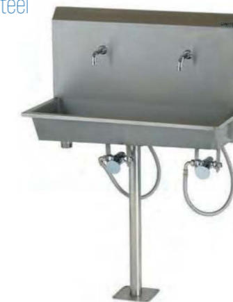
Pedestal version pictured