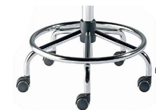
Built-in tubular footring. Resistance casters featuring a semi-soft tread that won't roll away easily