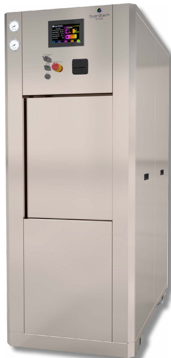
LAB300V free standing autoclave

● Other models in this range are the LAB150V and LAB225V which each share similar footprints and design characteristics