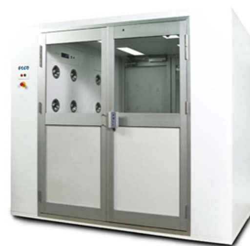
Multiple Occupancy Showers

Also available for installation. Call 0330 113 0303 or email sales@guardtech.com for more information.