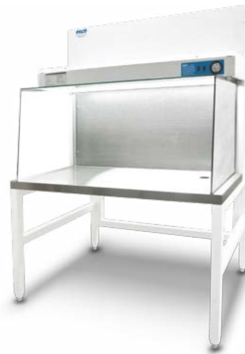
Airstream® Horizontal Laminar Flow Clean Bench (For Plant Tissue Culture)