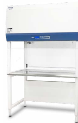
Airstream® Gen 3 Laminar Flow Clean Bench Vertical with Fixed Sash (Glass Side Wall)