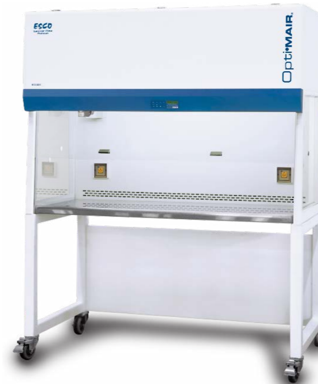
OptiMair™ Vertical Laminar Flow Clean Bench