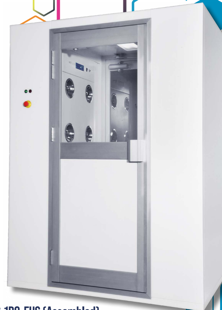
EAS-1B8-EUS (Assembled) Cleanroom Air Shower

● Mini-pleated HEPA filtration achieves > 99.999% typical efficiency at 0.3 micron particles