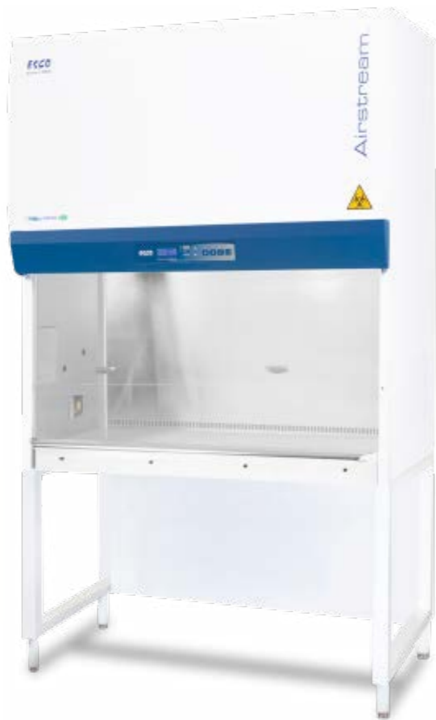
Airstream® Class II Biological Safety Cabinet Gen 3 S-Series

most energy-efficient Class II biosafety cabinet in the world, with 70% energy savings compared to AC motors. Self-compensating airflow, despite building voltage fluctuations and filter loading.