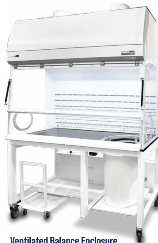
Ventilated Balance Enclosure