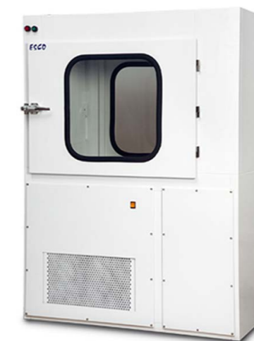
Infinity Air Shower Pass Box