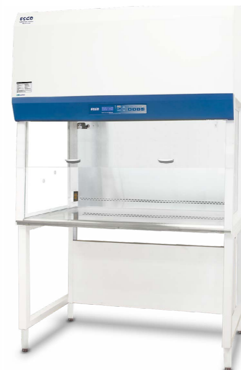
Airstream® Gen 3 Laminar Flow Clean Benches Vertical with Sliding Sash (Glass Side Wall)

● OptiMair Series Clean Benches are useful for mycology, food microbiology, plant and mammalian cell culture, clinical pharmacy and hospital protocols, cleanrooms, semiconductor assembly, pharmaceutical, aerospace and medical devices industries, where product protection is required for the user.