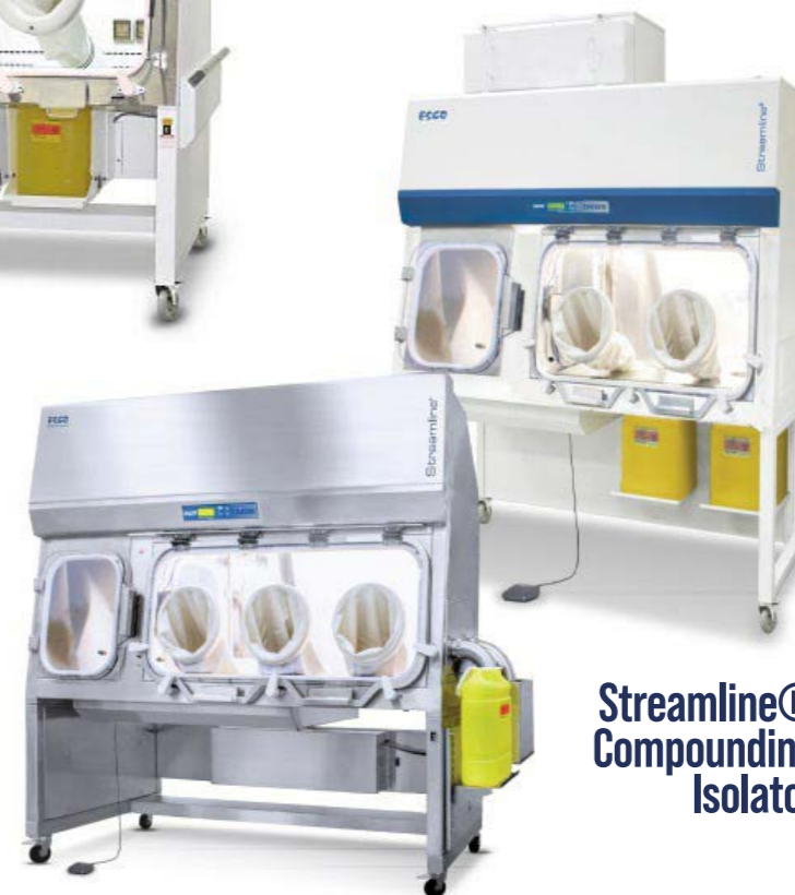
Streamline® Compounding Isolator