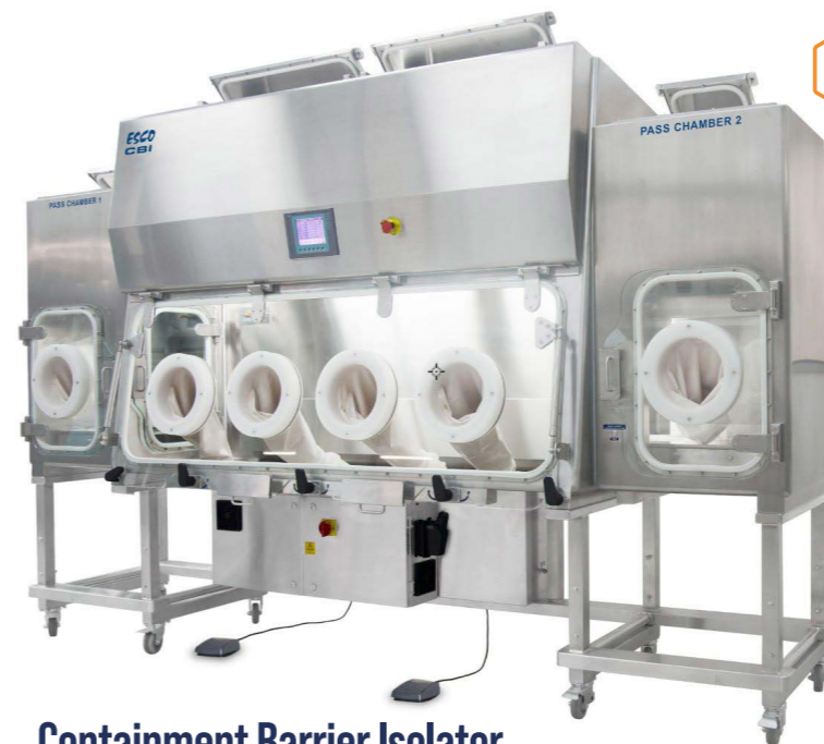
Containment Barrier Isolator