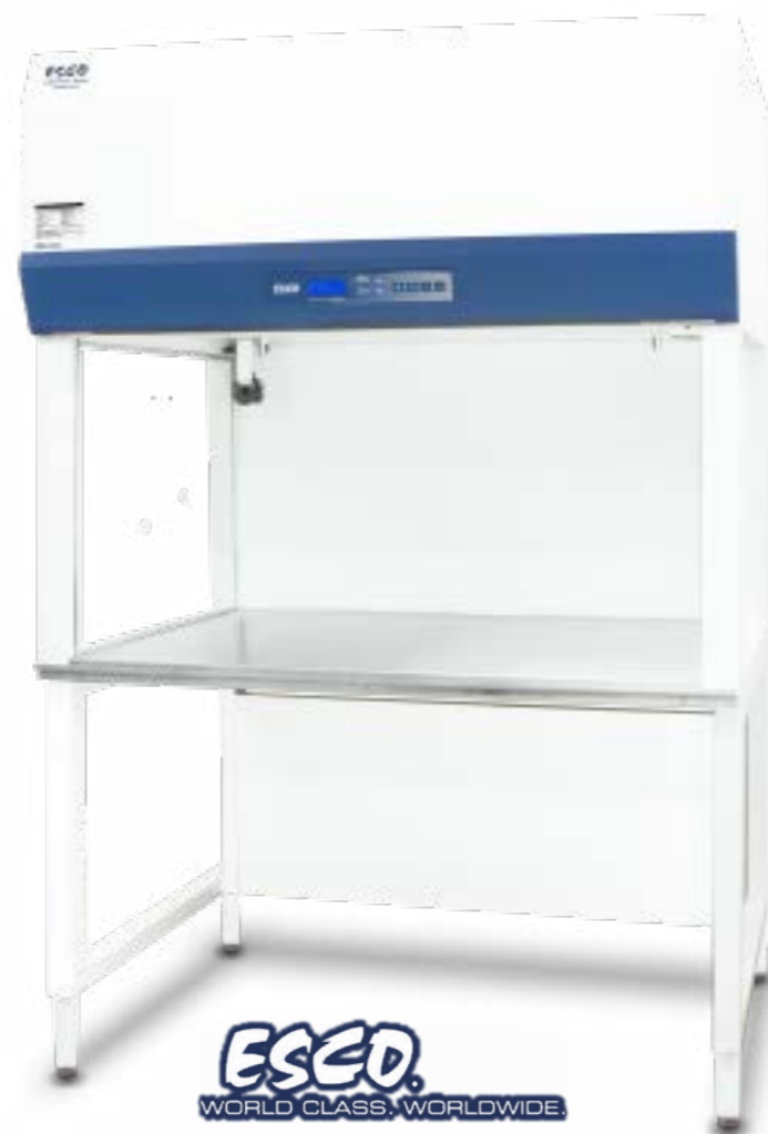
Airstream® Gen 3 Laminar Flow Clean Bench (Horizontal - Glass Side Wall)