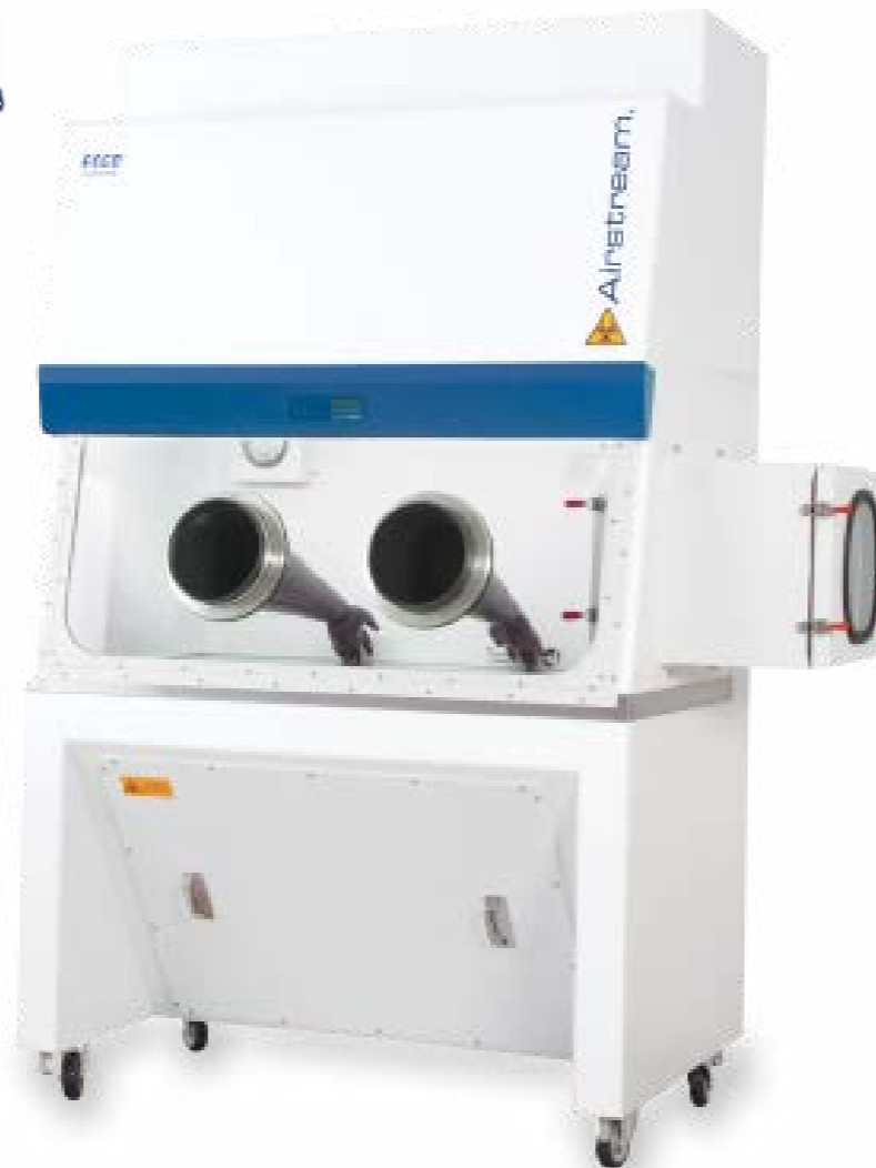
Airstream® Class III Biological Safety Cabinet

equipment, such as refrigerators, shelves, microscopes, centrifuges and incubators, can be installed inside the Class III cabinets upon request. Call 0330 113 0303 for more information on your cabinet options.