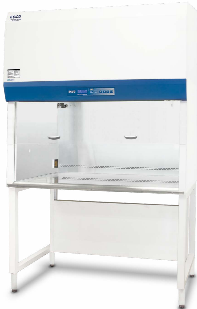
Airstream® Gen 3 Laminar Flow Clean Bench Vertical with Sliding Sash (Stainless Steel Side Wall)

the efficiency of its ULPA H14 filters. With more choice for customers, Esco laminar flow clean benches still offer the same level of product protection for your samples and processes where operator protection is not required.