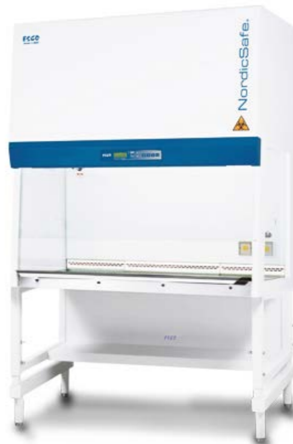
NordicSafe® Low Noise Class II Biological Safety Cabinet