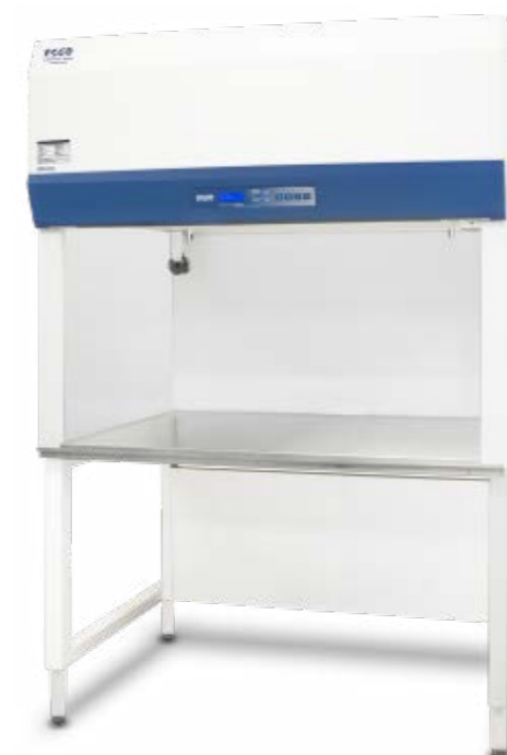
Airstream® Gen 3 Laminar Flow Clean Benches (Horizontal - Stainless Steel Side Wall)

● Ventilated Balance Enclosure (VBE) is designed for stability and accuracy while ensuring a high level of operator protection by containing hazardous airborne powder. Through the aerodynamic design sash and armrest, airborne particles are well contained inside the enclosure and exhausted through a HEPA filter or direct to the pharmacy exhaust.