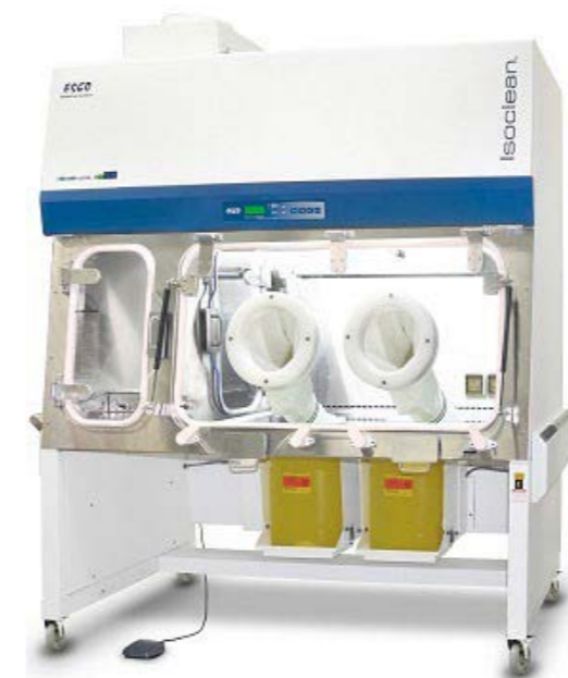
Isoclean® Healthcare Platform Isolator (Without Filter Below Work Zone)

Call 0330 113 0303 to speak with a Guardtech rep about all your equipment needs