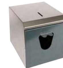
Centre pull roll dispenser