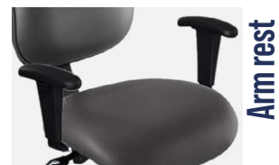
Optional arm rests – height can be adjusted & locked