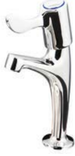
Lever 3" pillar tap