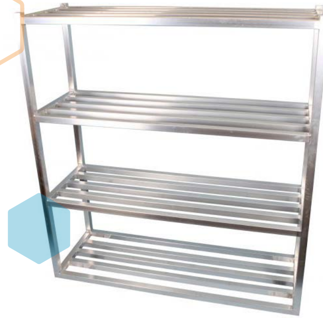
Four legs - four shelf units

For more info on these units, call 0330 113 0303