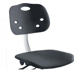
Seat and backrest made from Polypropylene containing UV inhibitor and antimicrobial properties