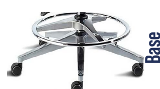
Resistance casters featuring a semi-soft tread that won't roll away easily