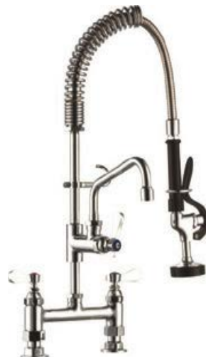
Short pre-rinse with pot filler