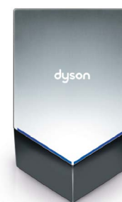
Dyson hand dryer