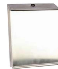
Paper towel dispenser