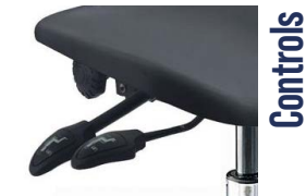
Task control with soft touch pneumatic adjusts seat height and backrest angle and height