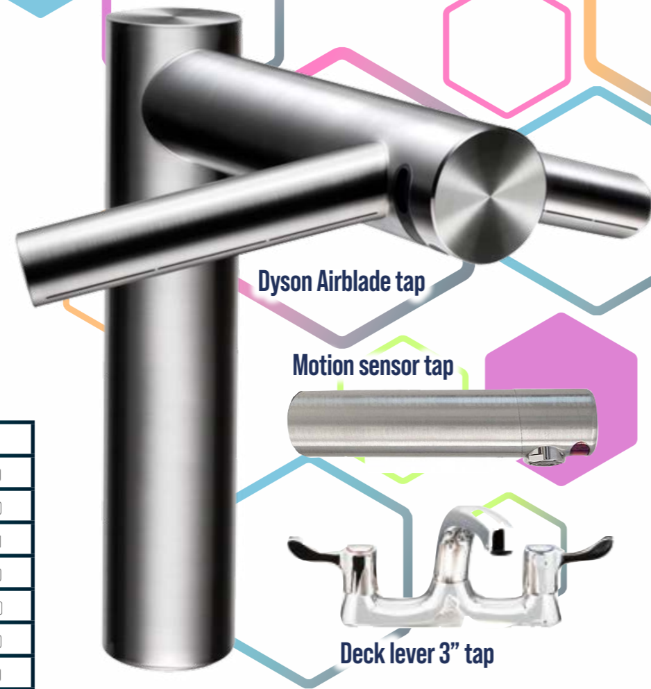
Dyson Airblade tap