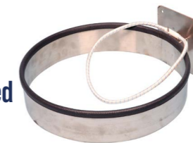
Wall-mounted bag holder