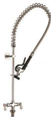
Pre-rinse mono block