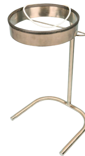
Waste bag holder