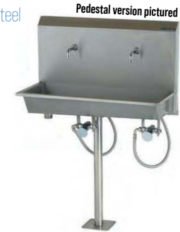
Pedestal version pictured