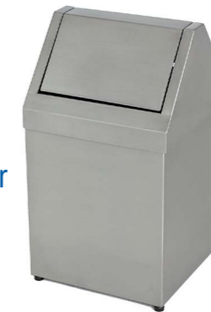
Flip lid bin