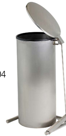
Shrouded pedal bin

● Waste sack holders in grade 304 stainless steel, open or shrouded units available with a hands-free system using a foot pedal to operate the lid, eliminating hand contact and minimising the risk of contamination.