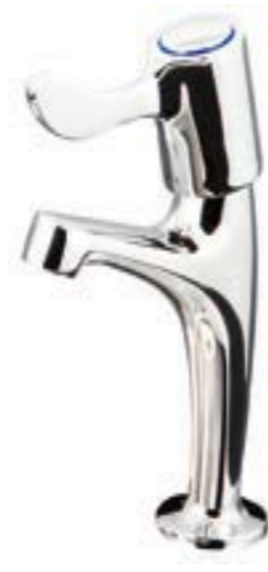
Lever 3" pillar tap