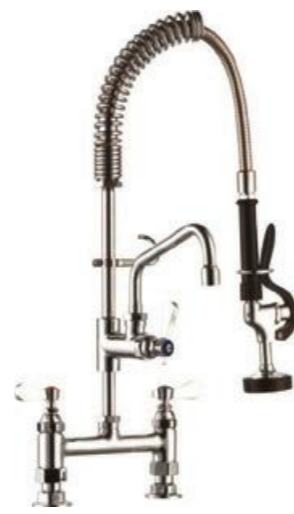
Short pre-rinse with pot filler